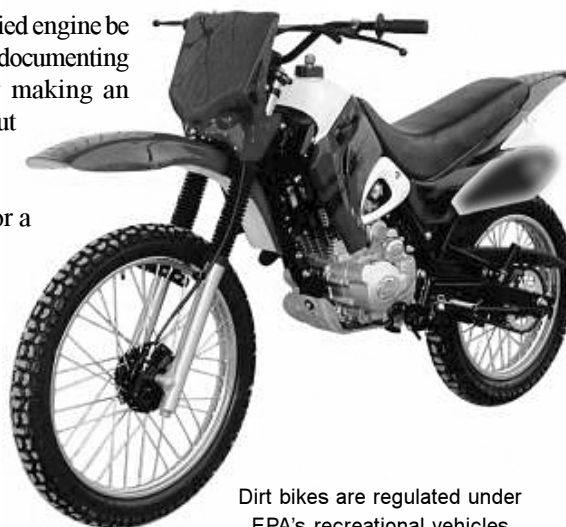
Dirt bikes are regulated under EPA's recreational vehicles provisions, 40 CFR parts 1051 and 1068.