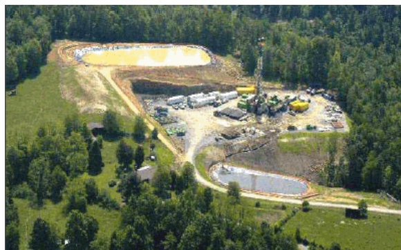
Hydraulic fracturing operation.

The final study plan looks at the full cycle of water in hydraulic fracturing, from the acquisition of the water, through the mixing of chemicals and actual fracturing, to the post-fracturing stage, including the management of flowback and produced or used water as well as its ultimate treatment and disposal. The initial research results and study findings will be released to the public in 2012. The final report will be delivered in 2014.