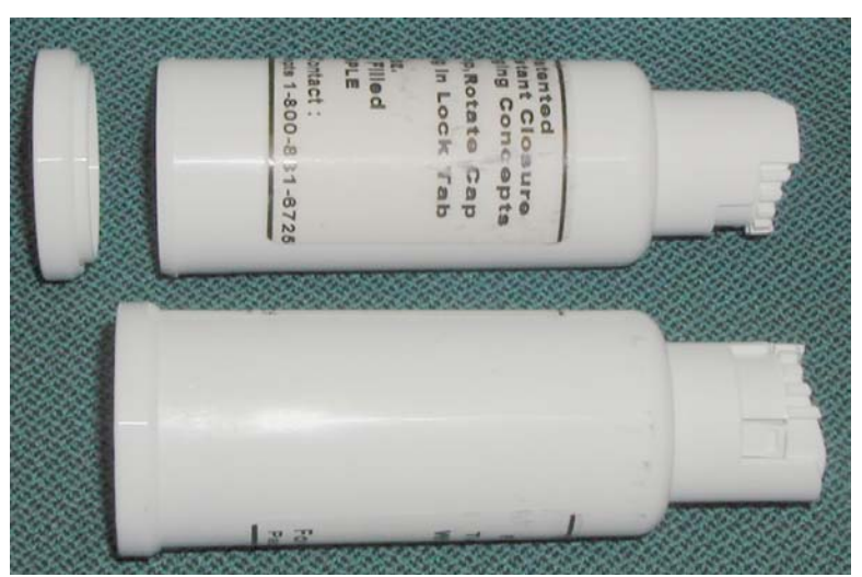
Figure 1A Figure 1B

The Mpak incorporates a tamper evident feature over the "U" shaped cut-out in the plastic housing (see arrow in package on right in Figure 2). The "U" shaped cut-out in the plastic housing is the position for the actuator to dispense product (see package on left in Figure 2).