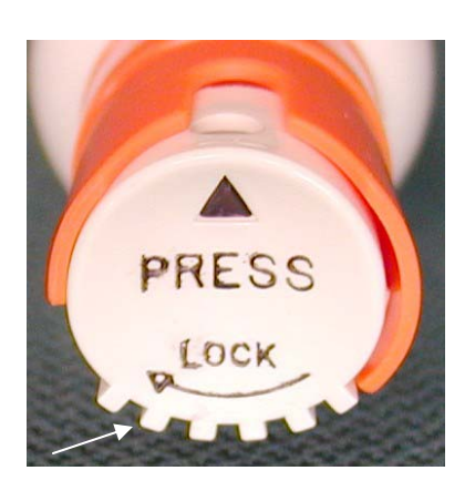
Figure 5 Figure 6A Figure 6B

The manufacturer's instructions on the CR Mpak and Snap-on Dispensing System are the same. These instructions are below (Figures 5, 6A, and 6B):