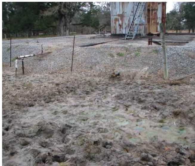
Source of oil and produced waters that were discharged