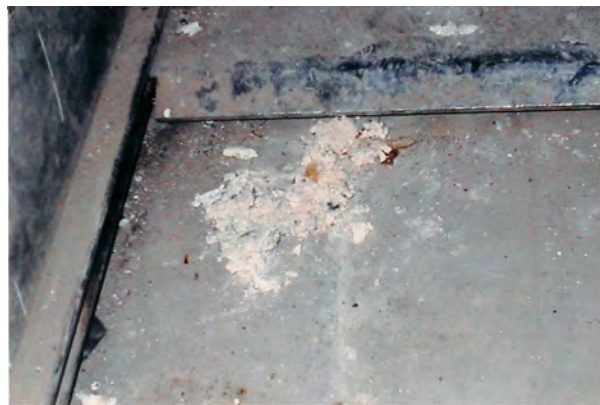
Regulated asbestos containing material pipe insulation debris.