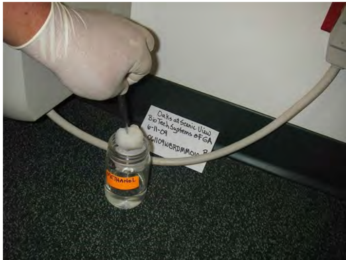
Georgia Department of Agriculture Inspector taking samples to be tested for the presence of Termidor inside the nursing homes.