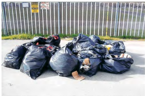
Garbage bags with regulated asbestos containing pipe insulation.