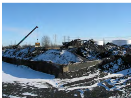
Coal tar concrete pad where decanter tank tar sludge (K087 - listed hazardous waste) should have been mixed with coal prior to placing the mixture into the coke oven battery.