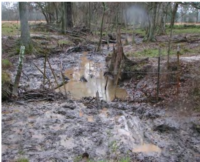
Oil contamination along slough