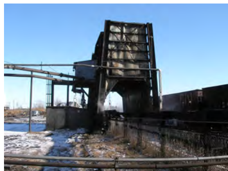
East Quench Tower that required the installation of baffles for particulate emission control per the Title V air permit.