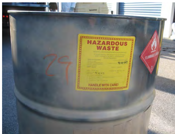
Hazardous waste tote and drum found inside a storage unit.