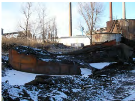
Storage tank that was dismantled for scrap metal and released coal tar sludge material that tested positive for benzene.

New York Coke Company and Manager Sentenced for CAA and RCRA Violations -- On March 19, 2014, TONAWANDA COKE CORPORATION was sentenced in federal district court for the Western District of New York to pay a $12.5 million penalty and $12.2 million in community service payments for criminal violations of the Clean Air Act and the Resource Conservation and Recovery Act. Tonawanda was convicted by a federal jury in March 2013 on 11 counts of violating the CAA and three counts of violating the RCRA.