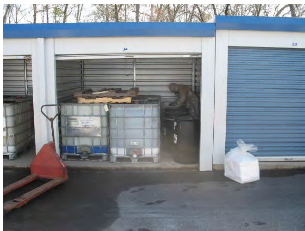
Assessment and removal of hazardous waste Lewis illegally stored inside storage unit 34 at Bass at Wesleyan self storage.