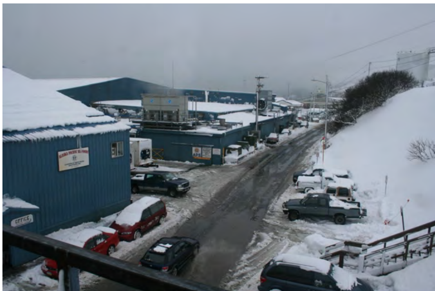
Alaska Pacific Seafoods Facility

Fish Processor Sentenced in Alaska for Illegal Dumping of Ammonia into City Sewer System -- On March 11, 2014, NORTH PACIFIC SEAFOODS was sentenced in federal district court for the District of Alaska to three years of probation, and $205,000 in criminal penalties, $55,000 of which is to be directed to the city of Kodiak for hazardous waste response training and equipment for sewer and fire department employees. North Pacific Seafoods pled guilty to a charge of illegal dumping of ammonia into the Kodiak city sewer. The terms of probation also require that North Pacific Seafoods comply with an Environmental Compliance Plan that includes, among other things, training for all employees at all five facilities in Alaska regarding proper handling of hazardous wastes and specifically ammonia.