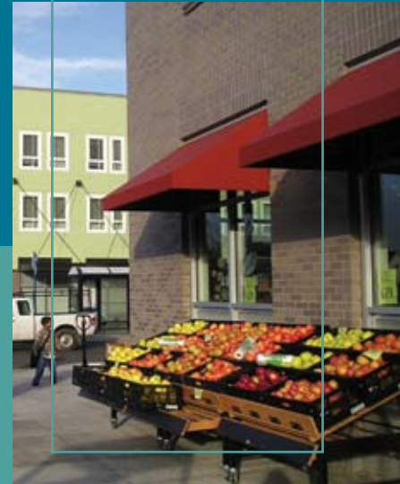
Amenities such as a local grocery store and wide sidewalks improve access for residents of all ages.

“ We moved back because it looks like a new city , with a lot of amenities and opportunities for both children and adults. I always wanted to come back because I like the part of town, I like the park , and it's close to where I work. ”