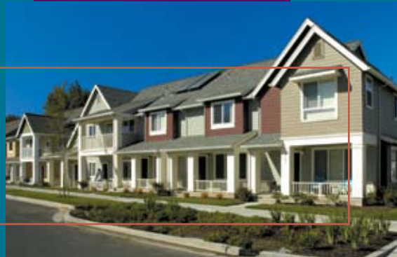
New Columbia's "green street" design, including 100 pocket swales helps reduce stormwater runoff.