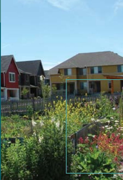
The creation of local community gardens builds a strong sense of place.