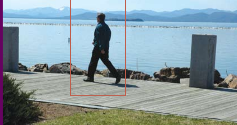
Utilizing VHCB's tools and funding, city officials created the Urban Reserve, which includes conservation easements—allowing limited development and improving access to the waterfront.

“Through strategic advice and grant awards, VHCB has been an active, engaged, and essential partner in helping the Town of Manchester add much needed affordable housing in its downtown while also helping to conserve high priority farmland that remains in active agricultural use today. We are most thankful for VHCB's assistance in helping us to achieve these key community goals. ”