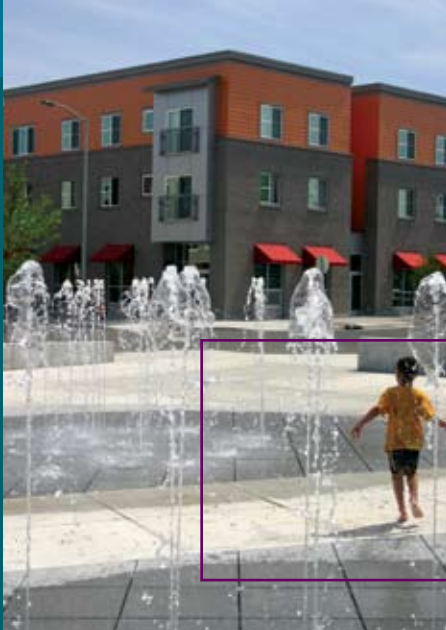
New Columbia provides a range of housing opportunities for residents of various incomes.