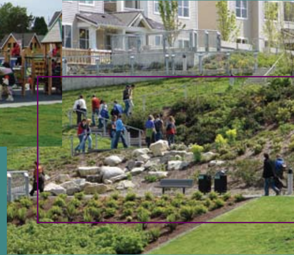
Pedestrian-friendly walkways encourage residents to walk, which reduces air pollution.

“The community is being built for the residents, not for the housing authority and not for the architects. It is being built with the opinion of the community .”