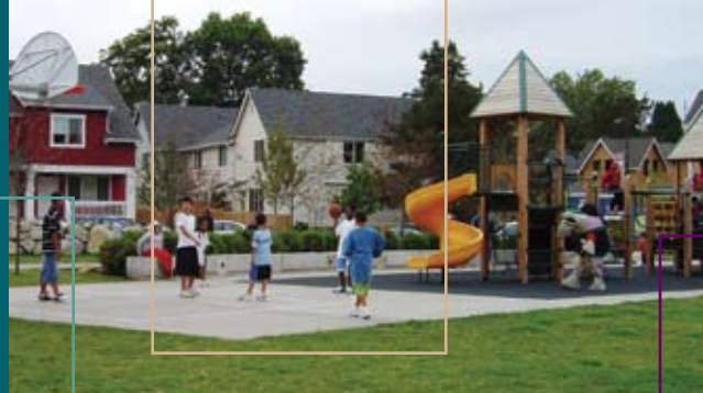
Through the use of compact development, the community preserved 12 acres of open space.