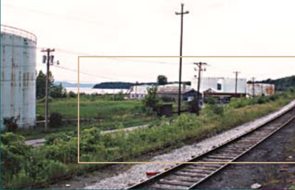
Prior to redevelopment, the banks of Lake Champlain were dotted with old oil tanks.