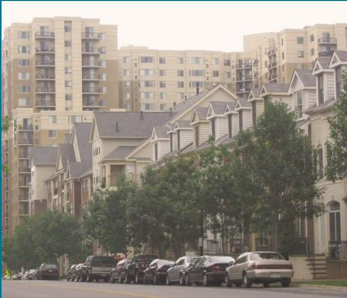
Development in Arlington County's Rosslyn-Ballston corridor.

“We really appreciated receiving the EPA’s Smart Growth Award. Not only because of the attention it focused on Arlington, but because EPA has helped us to explore ways of maintaining housing affordability in our transit corridors.”