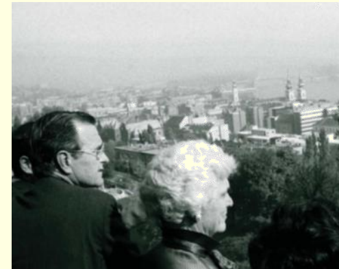
A Salute to President George Bush: A REC founding father