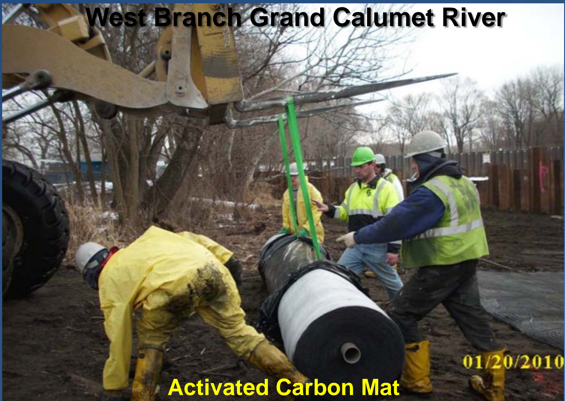
Activated Carbon Mat