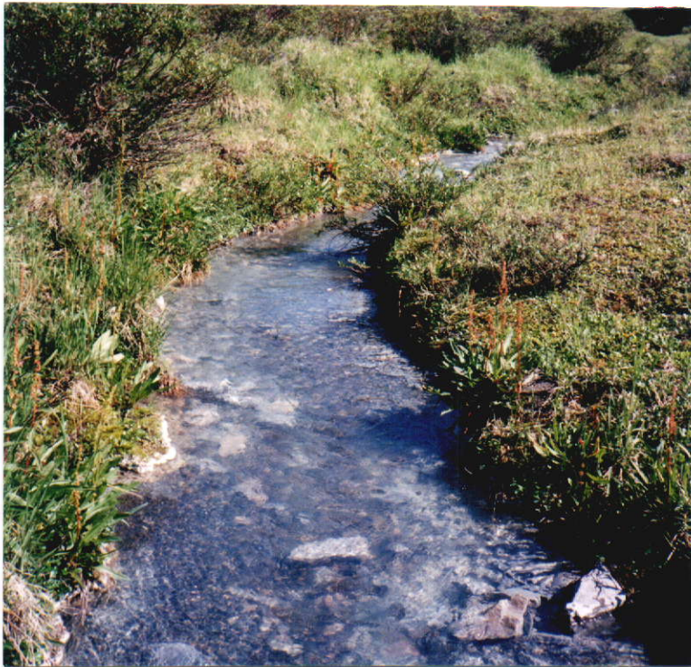
Figure 9. Rachael Creek.