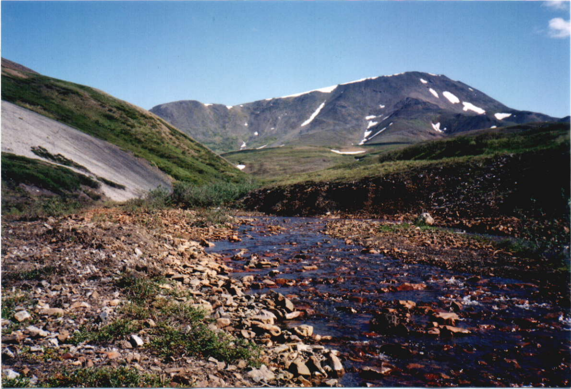
Figure 8. Connie Creek.