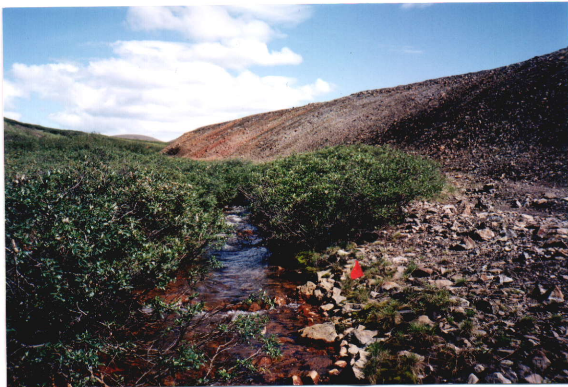
Figure 7. Shelly Creek.