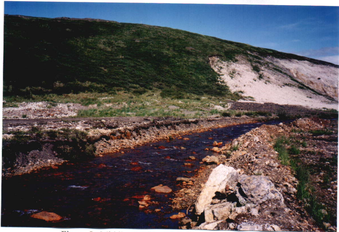
Figure 5. Middle Fork Red Dog Creek at Station 140.