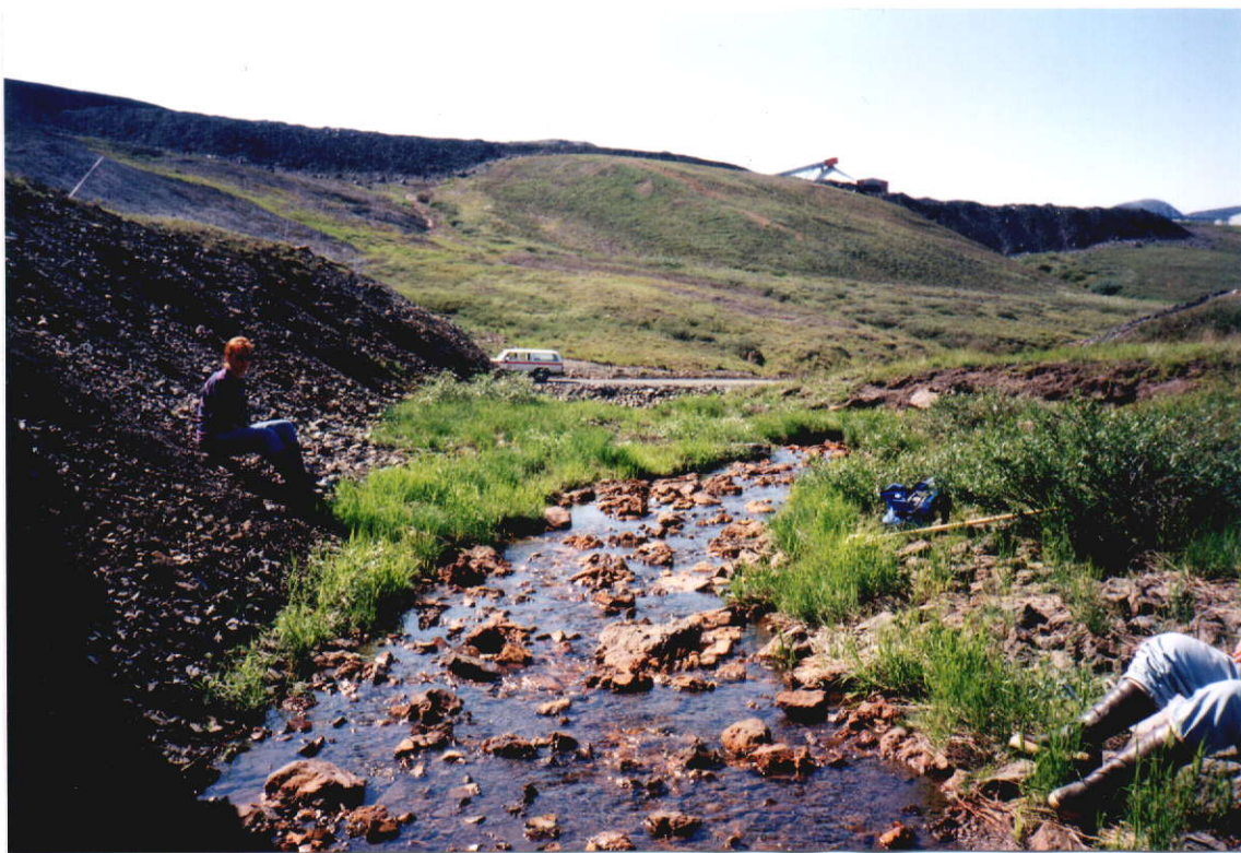
Figure 6. Sulfur Creek.