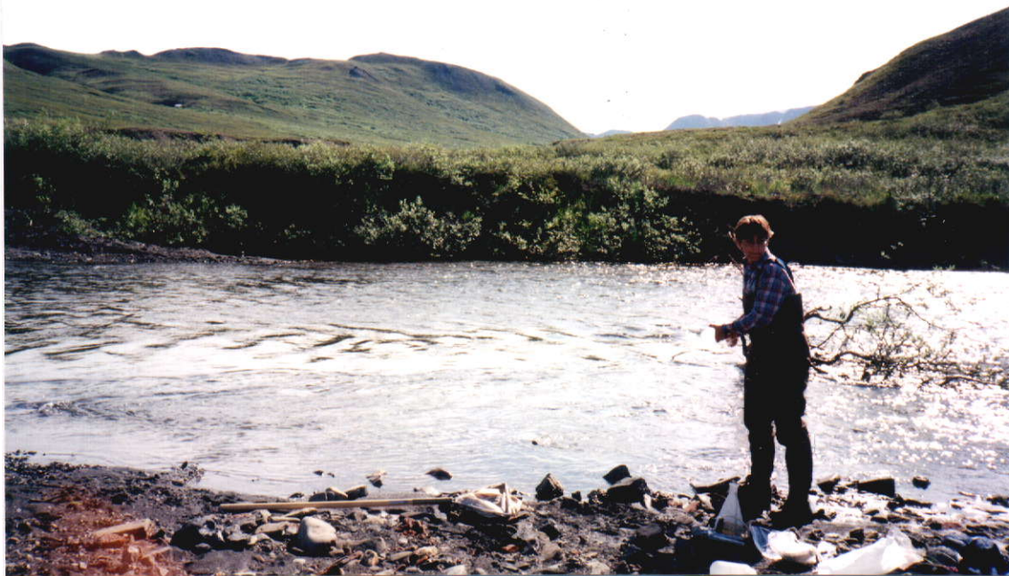
Figure 2. Ikalukrok Creek at Station 8.