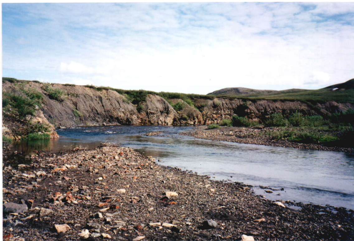
Figure 3. Mainstem Red Dog Creek at Station 10.