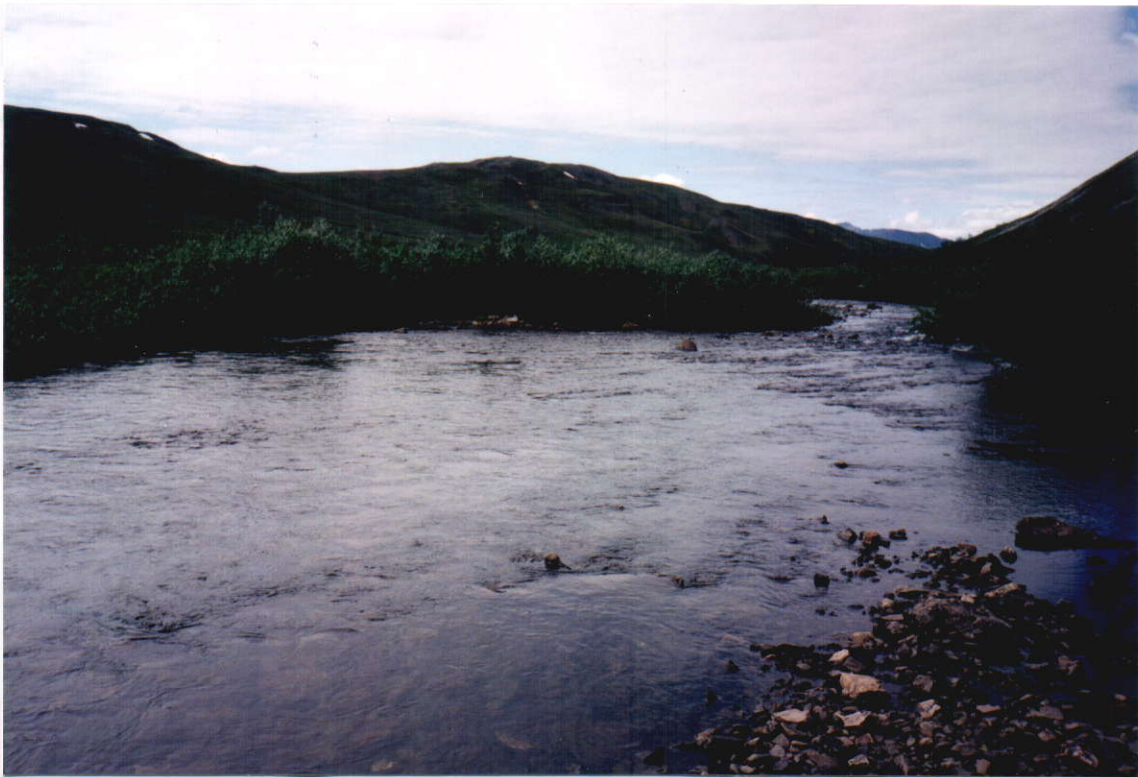
Figure 10. North Fork Red Dog Creek.

North Fork Red Dog Creek has a drainage area of 41 km 2 (15.9 mi 2 ). During the 1992 water year, North Fork Red Dog Creek had a high mean monthly flow of 3.5 m 3 /s (125 cfs) and low summer flows of 0.34 m 3 /s (12 cfs). Widths range from 7 to 15 m (24 to 50 ft) and depths from 0.09 to 2 m (0.3 to 6 ft). The stream bed is characterized by gravel, rocks, and small boulders and is subject to shifting. Temperatures range from 0 to 10°C during open water flow. Mineral staining is not evident in North Fork Red Dog Creek.