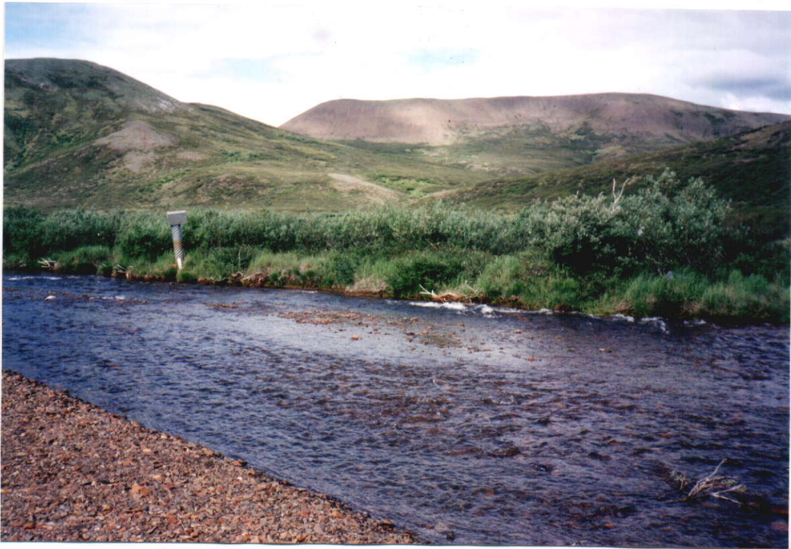
Figure 4. Middle Fork Red Dog Creek at Station 20.