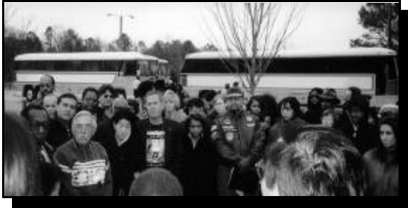
Exhibit ES-3: Members of the NEJAC and other participants listening to the environmental justice concerns of the Shiloh community near Durham, North Carolina.