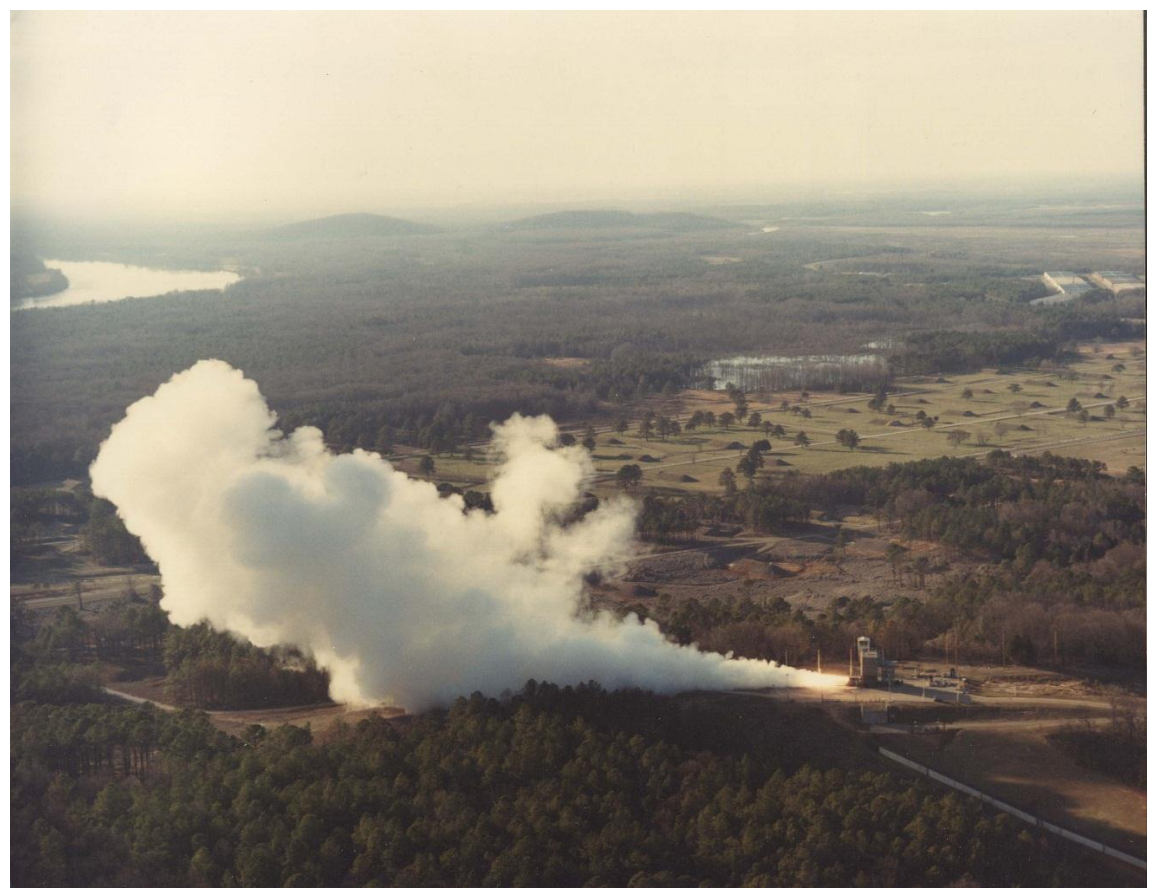
Figure 6: EDE emissions model validation test, static firing Pershing rocket motor

EDE personnel have extensive experience with the design and development of both wet and dry air pollution control systems, including the design and selection of combustion chambers, duct work, fans, filters, NOx reduction systems, baghouses, scrubbers, heat exchangers, and controls.