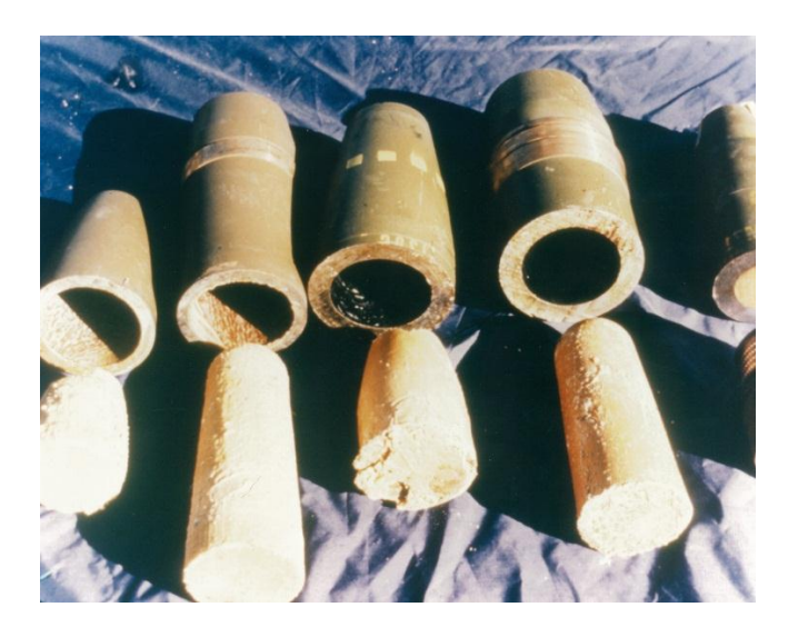
Figure 5: Slug Out