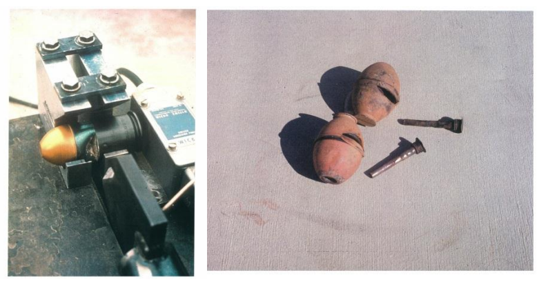
Figure 4: Punch Shear Operations

EDE is intimately familiar with size reduction problems associated with demilitarization (demil) or recycle of large propellant grains and munitions. EDE personnel have developed and tested shears, saws, punches, crushers, and other mechanical processes to access or remove explosives from munitions. EDE has also participated in a wide variety of projects that include steamout, washout, drillout, hogout, cavijet, microwave meltout, and cryowashout.