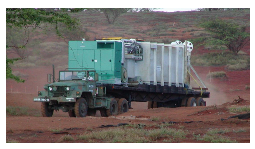
Figure 3: Transportable Flashing Furnace