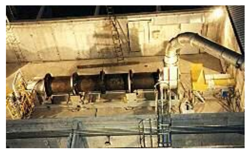
Figure 1: EDE Explosive Waste Incinerator, Germany

EDE is a small business with the flexibility to meet the client needs. EDE offers professional mechanical, electrical, and chemical engineering services along with each of our specialties described in more detail.