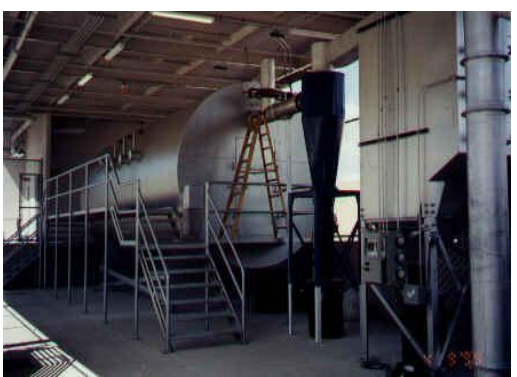
Waste PEP contained Burn System