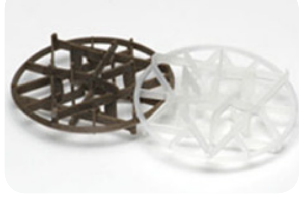
Sample plastic packing material.

Air stripping is an effective way of removing VOCs from contaminated water and is commonly used as part of groundwater pump and treat systems at sites around the country. Air strippers can be brought to the site eliminating the need to pump contaminated water for offsite treatment.