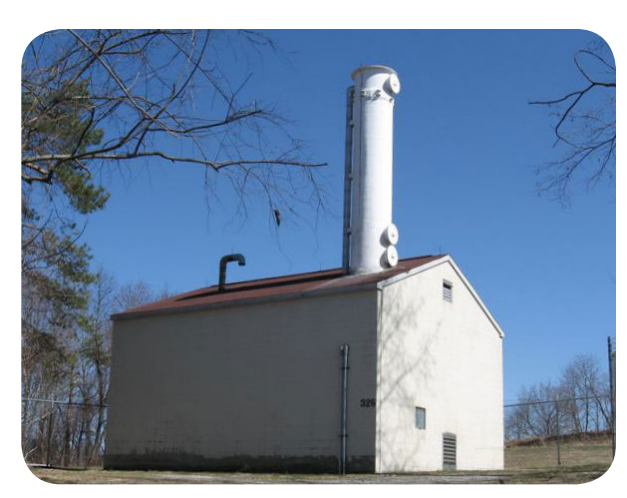
Air stripper and treatment building

Installation of the air stripper and treatment equipment may require use of heavy machinery, especially at large contaminated sites. Area neighborhoods may experience some increased truck traffic as the equipment is delivered. Large tanks or columns may be visible from the street and may need to operate for many years. However, care is taken to make sure the operation of air strippers is as quiet as possible.