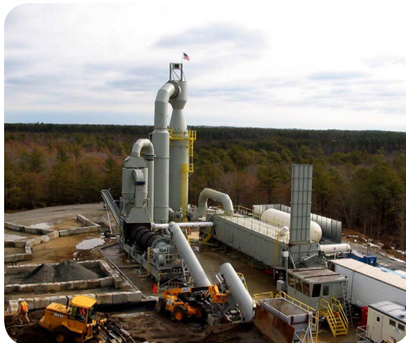
Onsite thermal desorber.

Thermal desorption is being used or has been selected for use at over 70 Superfund sites across the country.