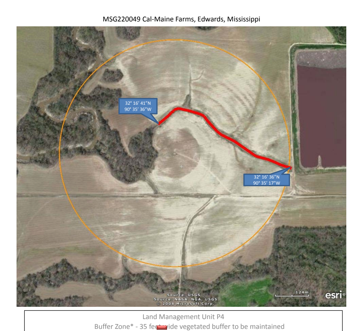
Figure 3 - Enhanced EPA Vegetated Buffer Diagram Land Application SOP