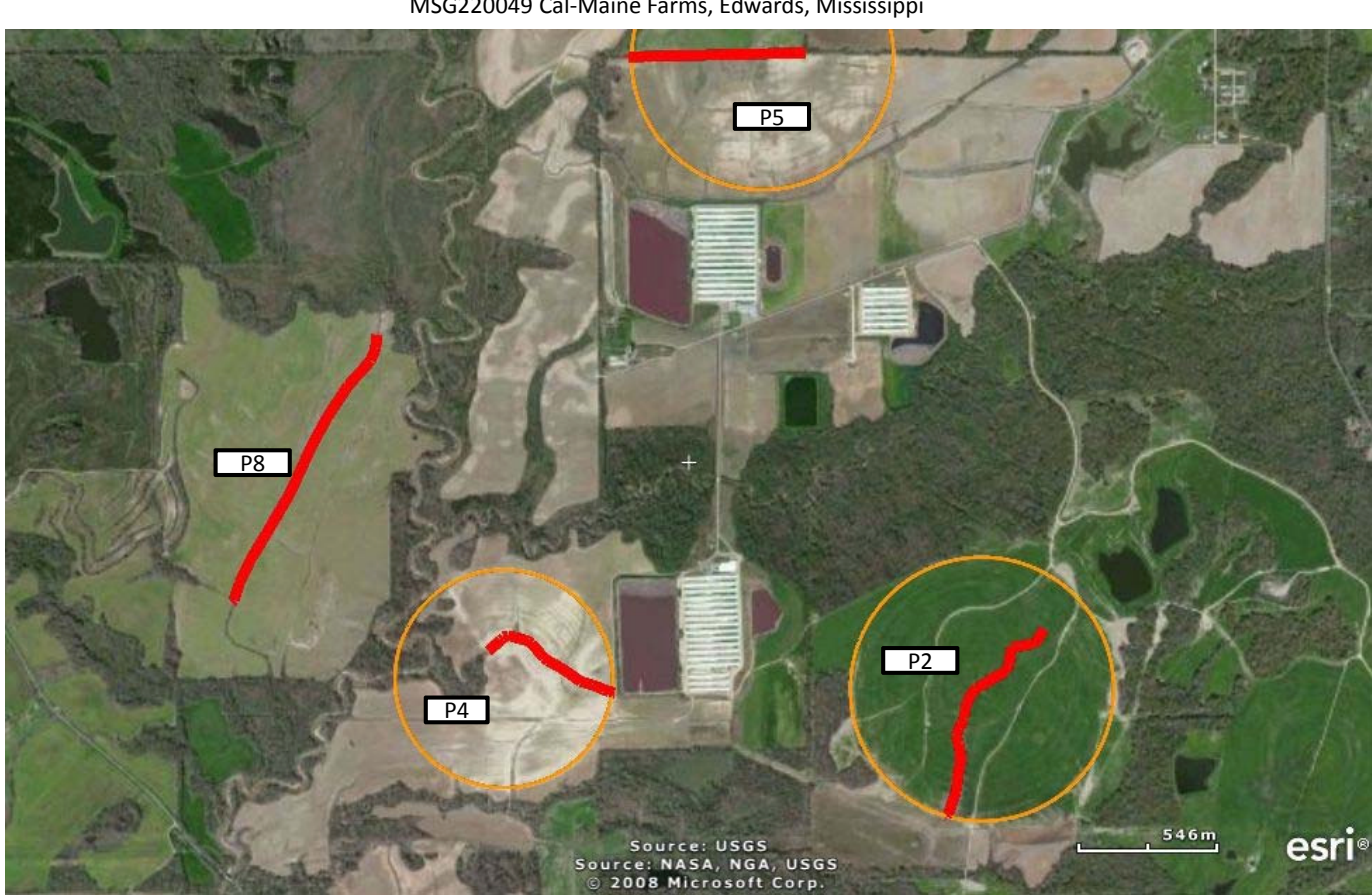
MSG220049 Cal-Maine Farms, Edwards, Mississippi

Land Management Units (LMU) aerial map ■ Buffer Zone*