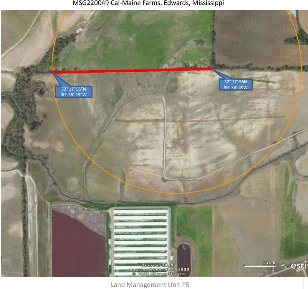
MSG220049 Cal-Maine Farms, Edwards, Mississippi

Figure 4 - Enhanced EPA Vegetated Buffer Diagram Land Application SOP