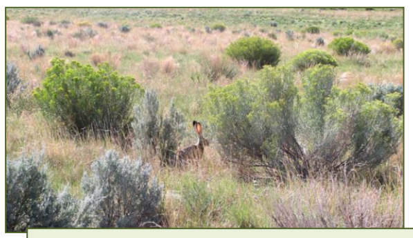
A capillary barrier ET cover at the Monticello Mill Tailings NPL Site in Utah was designed to mimic the area's ecology and follow the natural progression of revegetation. Native species existing atop the cover after seven years include gray rabbitbrush and sagebrush.

Another alternative design is an evapotranspiration (ET) cover system , which prevents infiltration of water into the contained waste.<sup>6</sup> An ET cover relies on a thick soil layer with vegetative cover capable of storing water until it is transpired or evaporated. ET covers perform best in arid and semi-arid environments such as those found in parts of the Great Plains and western states.<sup>7</sup>