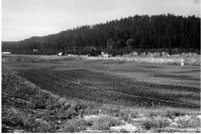
Figure 2. Land treatment unit.

Surface Soil Bioremediation. The LTU consists of two adjacent 1-acre cells, lined with low-permeability materials to minimize leachate infiltration from the unit (see Figure 2). Contaminated soil is applied to the cells in 9-in. lifts and treated until target contaminant levels are achieved within each lift. Evaluation of the effectiveness of the land treatment includes sampling the soil in the LTU, studying field-scale treatment and toxicity reduction, analyzing the influence of moisture and temperature, and evaluating the downward migration of PAH and PCP within the LTU.