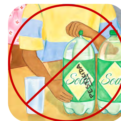
No traiga pesticidas agrícolas a su hogar.