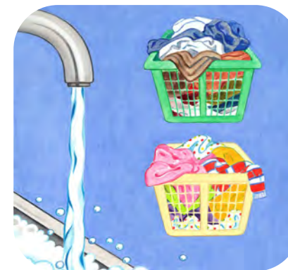
Wash your work clothes separately from the family's clothes.