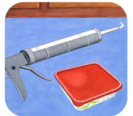
Prevent insects from entering your home by sealing cracks and keeping the house clean and dry.