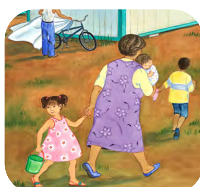
Close windows, turn off ventilators, and cover outside equipment when pesticides are being sprayed near your house.