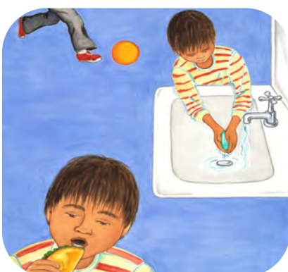
Have the whole family wash their hands before eating, drinking, or going to the bathroom.