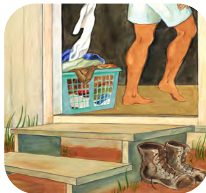
Remove work boots before entering the house.