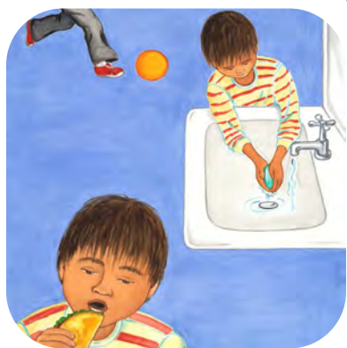
Lávese las manos y las de toda la familia antes de comer, tomar refrescos, o ir al baño.