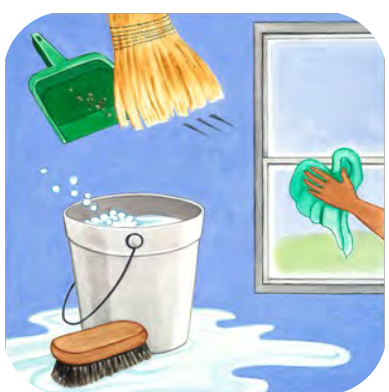
Limpie bien los lugares donde pueden entrar los residuos de pesticidas.

Lave las frutas y verduras antes de comerlas.