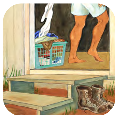
Quítese las botas antes de entrar a la casa.