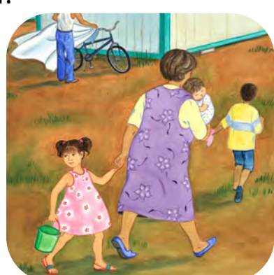
Cierre las ventanas y cubra el equipo de afuera cuando están rociando cerca de su casa.