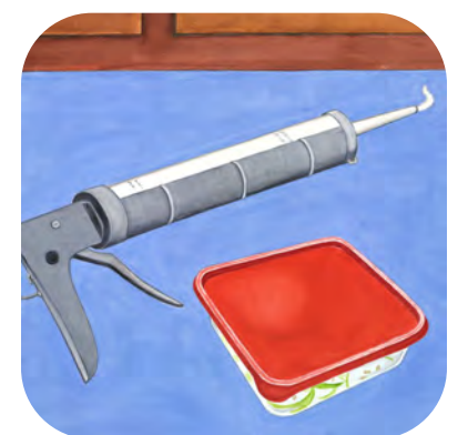
Prevenga la entrada de los insectos a su casa e utilice alternativas a los pesticidas.