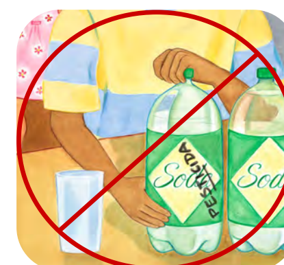
Do not bring agricultural pesticides home.