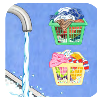
Lave su ropa de trabajo separada de la ropa de su familia.