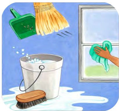
Clean thoroughly the places where pesticide residues can be found.

Wash fruits and vegetables before eating them.