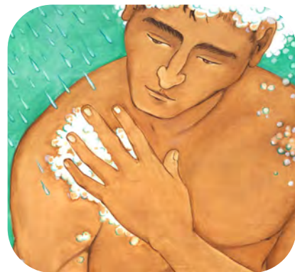
Bathe with shampoo and soap directly after work.