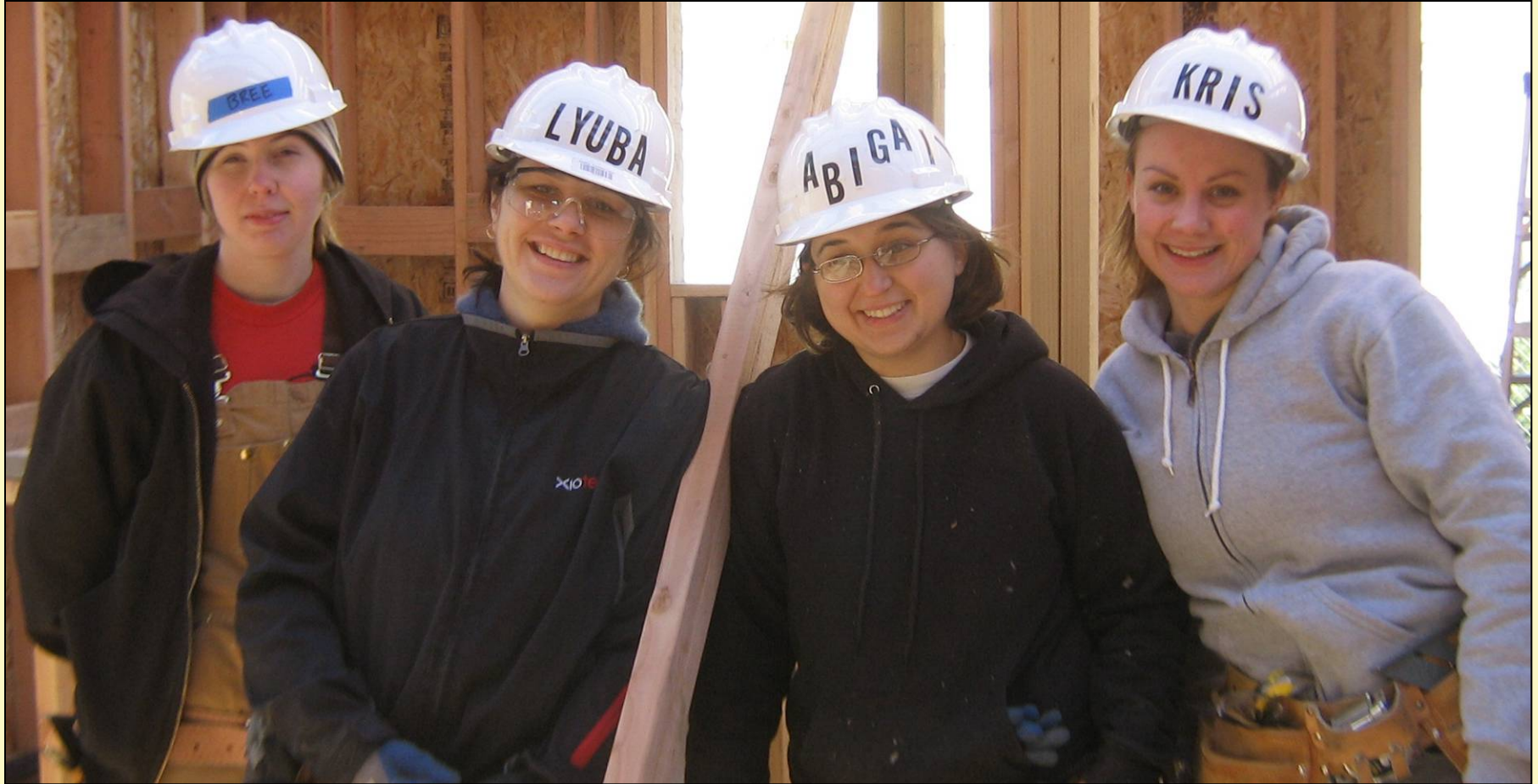
Participants from the Oregon Tradeswomen, Inc. Brownfields Job Training Program.