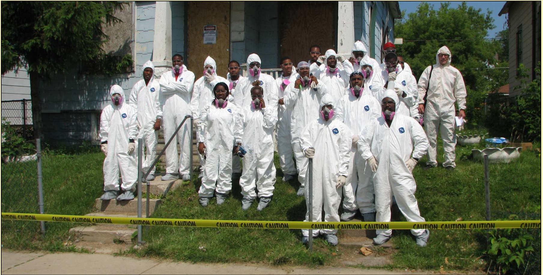
The Milwaukee Community Service Corps Job Training Class on site.