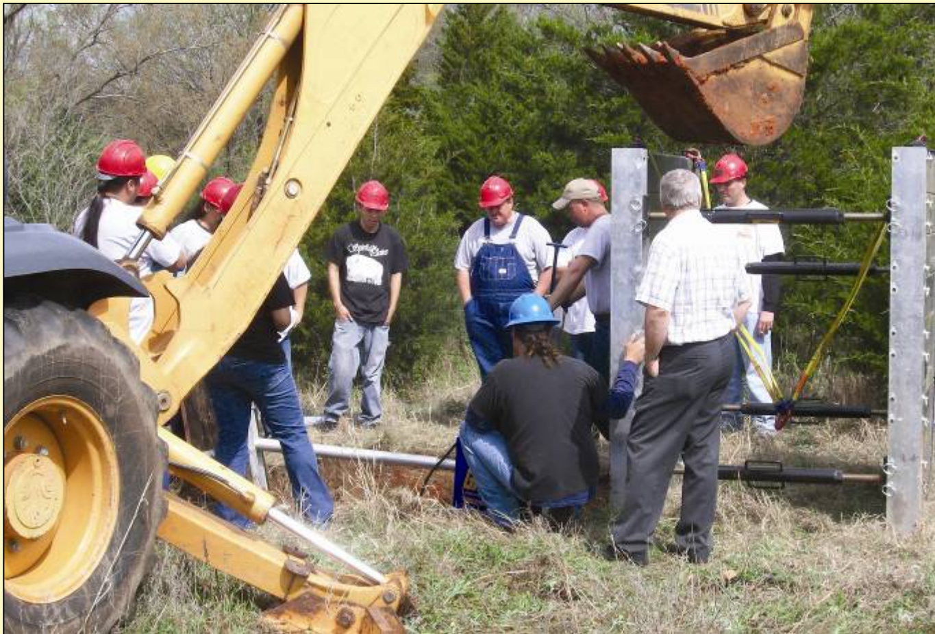
Students in the Absentee Shawnee Tribe Brownfields Job Training Program, participating in onsite training.