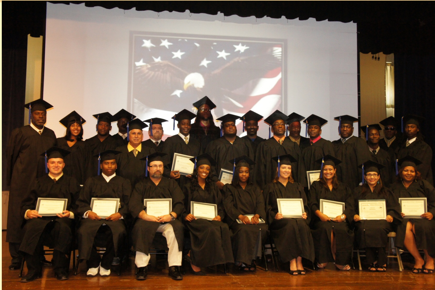
Students Graduating from Florida State College-Jacksonville's EWDJT program, August 29, 2011