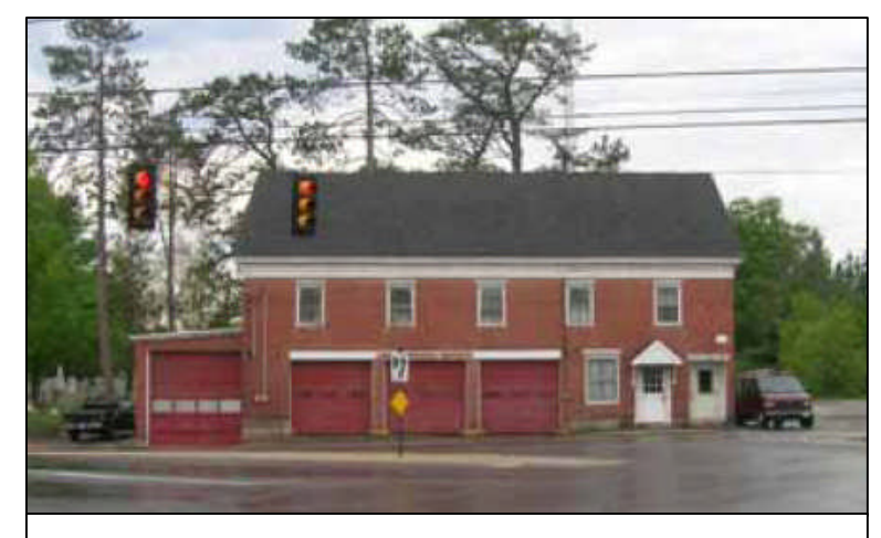
Main Street Fire Barn Gets Some Well Deserved Attention

The Main Street Fire Station lies on 0.11-acres in the village of Gray. The property is occupied by a two-story building with a footprint of 2,740 square feet. Built in the 1800's, the building was used as a church, town office, and meeting hall. In the 1970's, the town offices moved and the building was occupied by the fire department. Although