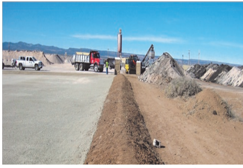
Waste Staging Area and Berm for Mormon Farms Removal Action