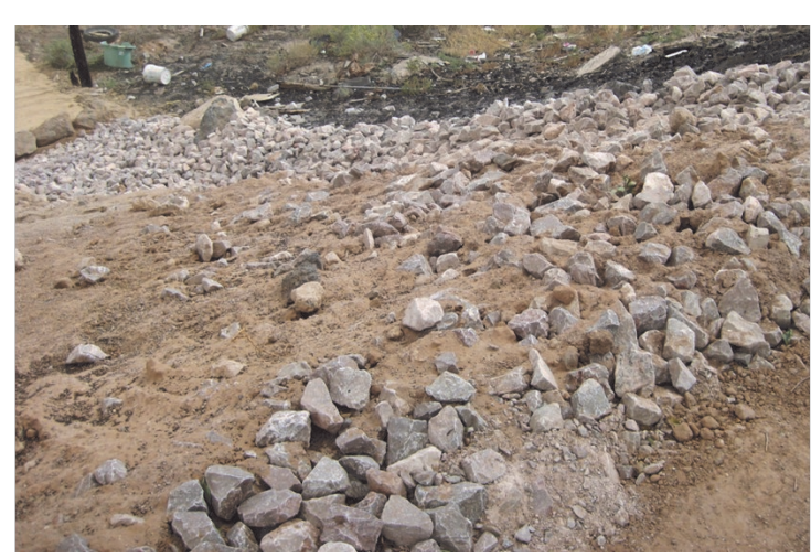
Soil excavation, backfill with clean soil, and rock placement for armoring at residence.

Continue to field questions from the public regarding potential sources of exposure to Uranium and how to reduce exposure.