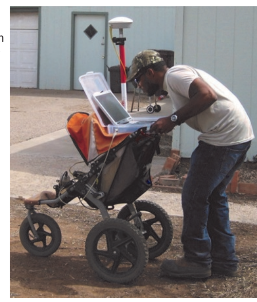
Radiological Survey Buggy

The Grants Mining District comprises an area of 100 miles by 25 miles where uranium extraction and production activities occurred from the 1950s to the late 1980s. There are 97 legacy mines in the district with the potential for physical hazards such as open adits and shafts, radiation, and the release of hazardous