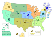
Contact Your State's Representative