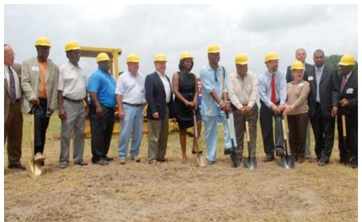
Ground breaking ceremony for Lamont Demonstration Project

The community of Lamont, Mississippi, used decentralized wastewater treatment including a septic tank effluent gravity (STEG) collection system. This system was more affordable than conventional treatment and better served the rural community because of its simple operation and maintenance, low energy requirements and low operation and maintenance costs. This project is 'green' because it uses energy wisely and allows the community to reuse its wastewater in beneficial ways.