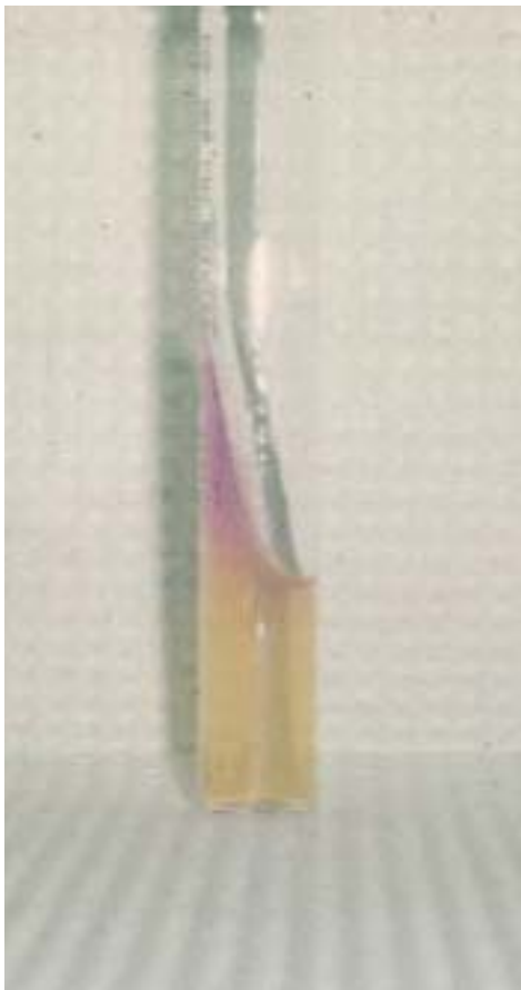
Figure 2. Weak urea reaction of B. melitensis at 24 h. on Christensens's agar