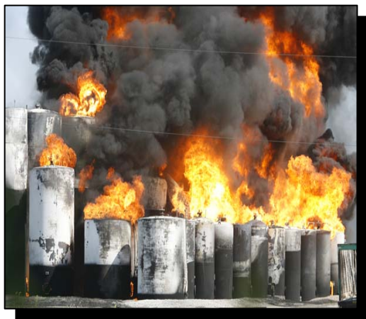
Barton Solvents explosion in Des Moines, Iowa, October 29, 2007

Competent and energized LEPCs are more likely to have a proactive approach and respond effectively to their community emergency needs. It takes conscientious effort to maintain the participation of LEPC members through innovative ideas, practical exercises, constant motivations and incentives. The bottom line is that effective planning saves human lives and reduces property losses and environmental impacts during emergencies.