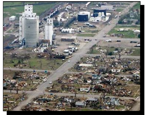
Greensburg, Kansas, devastated by an EF5 tornado, May 4, 2007

Hurricane Katrina, which devastated coastal areas of Louisiana and Mississippi in 2005, is another example of an event that generated significant interest in emergency planning. Better advance planning and preparedness could have improved emergency response, which likely would have minimized loss of life.