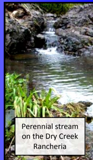
Perennial stream on the Dry Creek Rancheria

For more information, please refer to EPA Region 9's FAE Eligibility Handbook for Indian Tribes at: http://www.epa.gov/region09/water/tribal/tribal-cwa.html