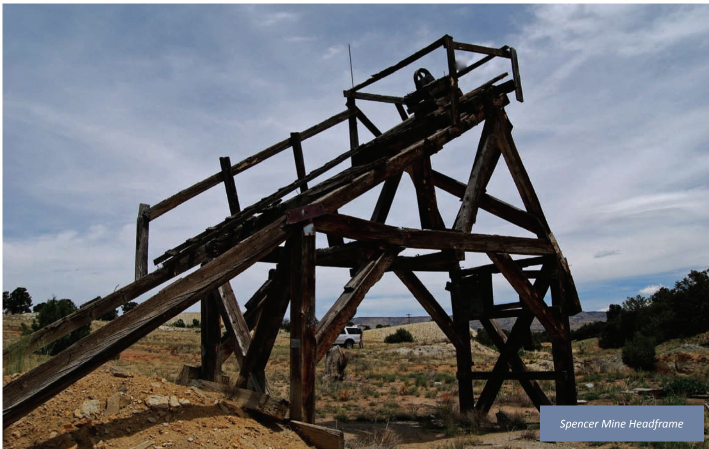
Spencer Mine Headframe

Other federal and state responsibilities include, in part, the following: