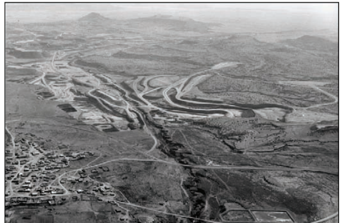
Jackpile Uranium Mine (historical) Aerial View

nuclear disaster. ( http://www.seekingalpha.com , Article by Simon Monger, Oct 31, 2011) In fact, some of the producers are just now getting all of the state and federal permits they need to begin production — permits which took several years to work their way through the regulatory process. Others sites are still early in the permitting process. Read more: http://trib.com/news/state-and-regional/article_841c5978-85eb-5fad-a050-ef3f05193292.html#ixzz1cUnANR3r