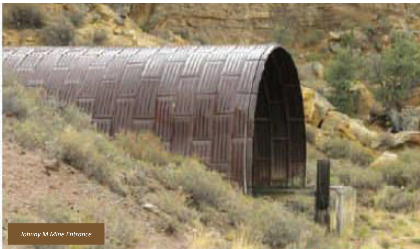
Johnny M Mine Entrance

EPA shares authority with NRC and the State of New Mexico in overseeing operations at in-situ leaching facilities. However, if the operation occurs on federal lands, the federal land management agency will also have a role. The NRC and NMED regulate in-situ leaching facility operations, including the injection of fluids, using environmental, radiation, and ground water protection standards developed by EPA in accordance with the UMTRCA. In addition to NRC requirements, operators of injection wells used at in-situ leaching facilities also must apply for and receive a Class III well permit and, if needed, a Class I well permit for disposal of fluids under the authority the UIC program. NMED issues permits for Class III solution mining wells.