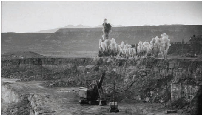
Jackpile Uranium Mine (historical) Blasting Operations

Uranium, radium and radon are naturally occurring radionuclides found in the environment. Uranium mill tailings contain the radioactive element radium, which decays to produce radon, a radioactive gas. The radium in these tailings will not decay entirely for thousands of years. The mill tailings pose a potential hazard to public health and safety. No information is available on the acute (short-term) non-cancer effects of the radionuclides in humans. Animal studies have reported inflammatory reactions in the nasal passages and kidney damage from acute inhalation exposure to uranium. Chronic (long-term) inhalation exposure to uranium and radon in humans may cause respiratory effects, such as chronic lung disease, while radium exposure has resulted in acute leukopenia, anemia, necrosis of the jaw, and other effects. Cancer is the major effect of concern from the radionuclides. Radium, via oral exposure, may cause bone, head, and nasal passage tumors in humans, and radon, via inhalation exposure, causes lung cancer in humans. Uranium may cause lung cancer and tumors of the lymphatic and hematopoietic tissues. EPA has not classified uranium, radon or radium for carcinogenicity. For more information, see EPA Integrated Risk Information System (IRIS) and the Agency for Toxic Substances and Disease Registry's (ATSDR) Toxicological Profiles for Uranium, Radium, and Radon .