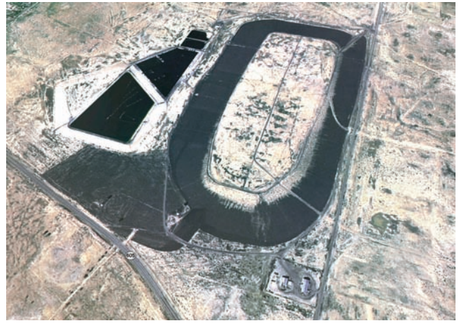
Homestakes Mining Company Superfund Site Tailings Piles

Title I specifies the inactive mill sites for remediation. Under Title I, EPA establishes standards for cleanup and disposal of contaminated material. The U.S. Department of Energy (DOE)