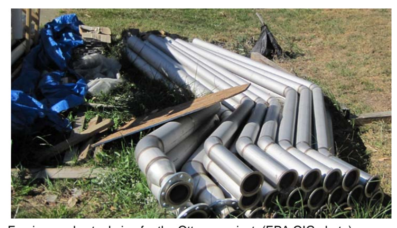
Foreign-made steel pipe for the Ottawa project.

manufactured in the United States. In two instances, we identified materials on site as foreign made. The federal grant to capitalize Illinois's revolving loan fund with Recovery Act funds required that all projects use manufactured goods produced in