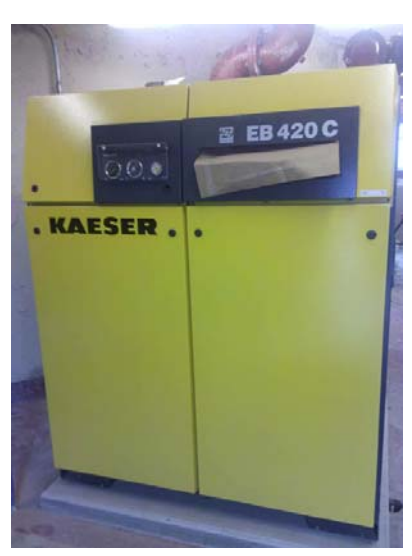
Kaeser blower.

Kaeser Compressors, Inc., provided a letter to Ottawa dated October 29, 2010, to support substantial transformation. The letter stated that for Recovery Act–funded projects, the company purchases a base chassis of proprietarily designed components from the parent company, Kaeser