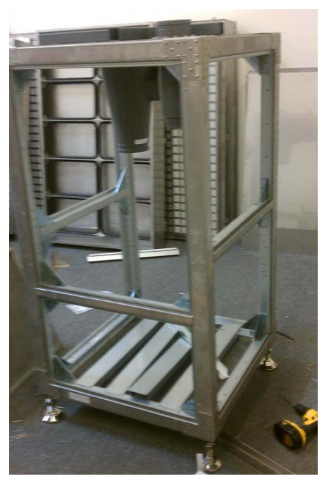
Chassis assembled in Batavia from parts shipped from Korea.

Both the contractor's report and the region's site visit summary included detail about the number or percentage of components that would be sourced from the United States. However, 2 CFR §176.70(a)(2)(ii) states, "there is no requirement with regard to the origin of components or subcomponents . . . as long as the manufacturing takes place in the United States." Therefore, the source of components cannot be part of the substantial