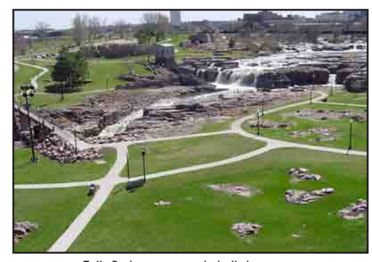
Falls Park was expanded all the way to downtown Sioux Falls through this project.