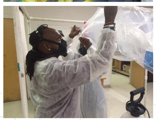
LEAD. INNOVATE, GENERATE RESULTS.