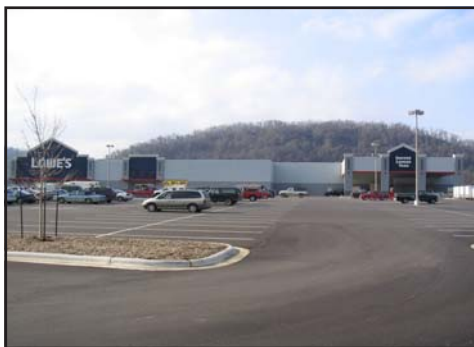
The completed Lowe's at Gateway Centre.

Center Wheeling was marred by blighted properties in the 1990s, and the city government has long attempted to improve the city's neighborhood. The city therefore targeted two brownfield properties for redevelopment—the CSX and Pavilack properties. The CSX property, which formerly included residential and commercial uses, was assessed with private funds in the late 1990s. The West Virginia Department of Environmental Protection determined that this property did not require cleanup. The Pavilack property was formerly used as an axle manufacturer, a foundry, and an automotive scrap yard. Nearly $70,000 in EPA Brownfields Assessment Pilot funds were used to fund Phase I and II assessment activities at the Pavilack property from 2000 through 2003. These assessments determined that cleanup was required on the property.