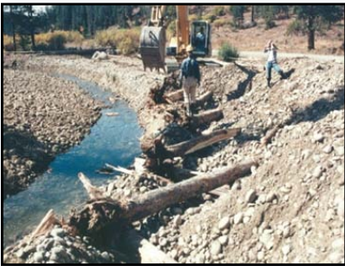
Figure 3. Restoring a streambank using buried revetments along North Fork Spread Creek.

slope and bed features (Figure 3). The effort also restored or enhanced the natural floodplain, riparian community and fish habitats. New riparian vegetation included a mixture of willows, grasses and forbs. Last, project partners moved an adjacent road to a higher elevation, which lessened the possibility of seasonal flooding and erosion.