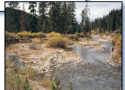
Figure 2. A braided channel along North Fork Spread Creek before restoration.

consumption, aquatic life, recreation, wildlife, industry, agriculture and scenic value uses. Sedimentation threatened the creek's cold-water fishery and aquatic life designated uses, prompting WDEQ to add a one-mile reach of the creek to the