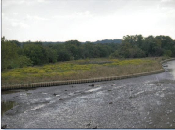
Figure 3. Three years after construction, the area is densely vegetated.

to throw them into the wetland cells. The wild rice plants, in addition to many other planted species, have flourished over the past 7 years (Figure 3).