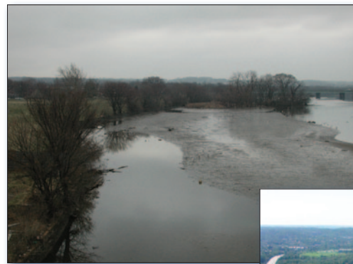
Figure 1. Before construction, the River Fringe Wetland site was a depositional mudflat.

Vegetation in a similar wetland restoration project conducted in 2000 suffered from significant grazing damage by numerous Canada geese that reside year-round on nearby National Park Service land. Learning from that, the partners opted to sufficiently raise the elevations of the River Fringe wetland restoration project to sustain a vigorous assemblage of wetland plants that would not attract resident geese. In addition, the partners