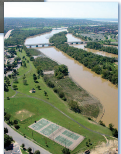
Figure 2. Project partners pumped sediment into two cells to create the River Fringe Wetland, seen here as the slight bulge of land extending into the river just beyond the tennis courts.

The partners planted seven species in the River Fringe project area, the vast majority of which are unpalatable to Canada geese. One species of interest, Zizania aquatica (wild rice), historically dominated the wetlands. The Anacostia Watershed Society (AWS) reestablished that species using a unique method. AWS grew wild rice and collected the seed over the course of one growing season. It then embedded the seeds in mud balls and invited enthusiastic school children