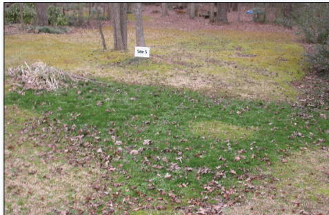
Figure 2. Two photographs of the same site in the Jacks Creek watershed indicate a failing septic system. The standard photo (top) shows an isolated area of thick green grass. The red area seen in the infrared photo (bottom), shows that the isolated grassy area is also warmer than the area surrounding it.

The county's CIR septic survey used aerial photography to identify actively failing septic systems. The photographic analysis process involves visually examining and comparing many components of individual photographs, including shadow, tone, color, texture, shape, size, pattern and landscape. The photographic analyst identified signatures associated with specific environmental conditions or events. After an analyst identified possible failure sites through CIR, county staff members completed ground verification inspections to identify areas of surfacing effluent from failing septic systems (Figure 2). That effort helped to identify 18 failing septic systems in the Jacks Creek watershed