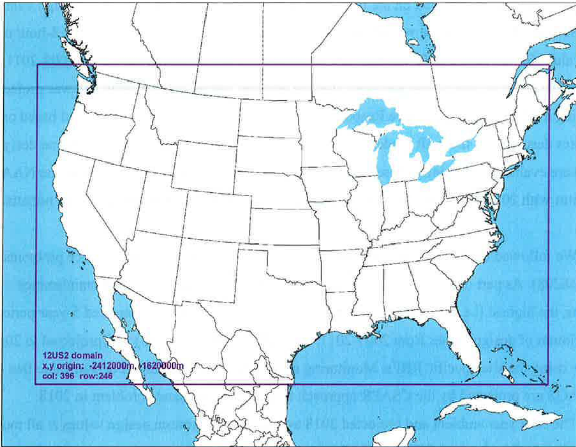
Figure 1. Air quality modeling domain (area within the purple lines).