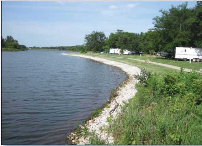
Figure 2. Riprap was added to stabilize almost 2,000 linear feet of the upper east arm of Yellow Smoke Lake.

(2) that sediment retention structures be put in place to prevent sediment from entering the lake through watershed runoff. The success of restoration efforts would be measured on the basis of improvements in affected fish populations.