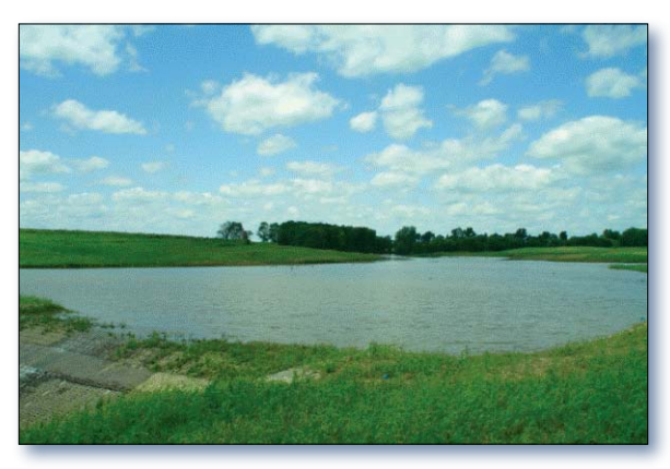
Figure 2. Example of a sediment pond constructed along a tributary stream in an agricultural watershed. The pond is designed to remove suspended and soluble nonpoint source pollutants.

Data collected in 1992, 2004 and 2009 show dramatic improvements in dissolved oxygen and sediment levels in Honey Creek. While dissolved oxygen levels failed to meet state water quality standards in 2002, levels increased to 8.22 mg/L by 2004, which met the state minimum of 6.0 mg/L. Data show that by 2009, dissolved oxygen levels increased further to 10.4 mg/L—still meeting the applicable dissolved oxygen standard, which had changed in 2008 to include seasonal and various time-related requirements.