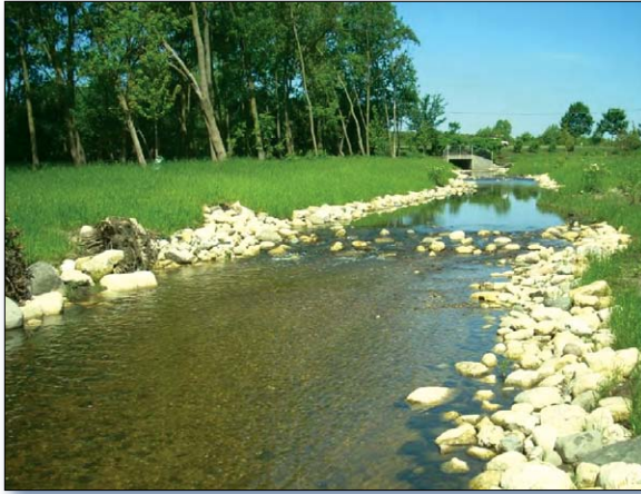
Figure 2. Stabilizing the streambanks on Seavey Ditch, a tributary to Indian Creek, helped to reduce erosion and improve water quality.