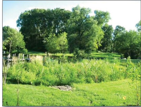
Figure 3. Watershed partners installed a 2,046-square-foot rain garden in West Shore Park to treat stormwater runoff from area roadways.

Using Clean Water Act (CWA) section 319 funding support, the watershed partners, including the Chicago Metropolitan Agency for Planning, AES Inc., and others, initiated an upgrade of the Indian Creek watershed plan in 2004 to make the plan consistent with U.S. EPA's guidance for watershed-based plans. The upgraded plan was aimed at improving water quality by controlling nonpoint source pollution throughout the watershed. The initial upgrade was completed in June 2006; the plan was updated again in 2008. The Indian Creek Watershed-based Plan was adopted in 2009.