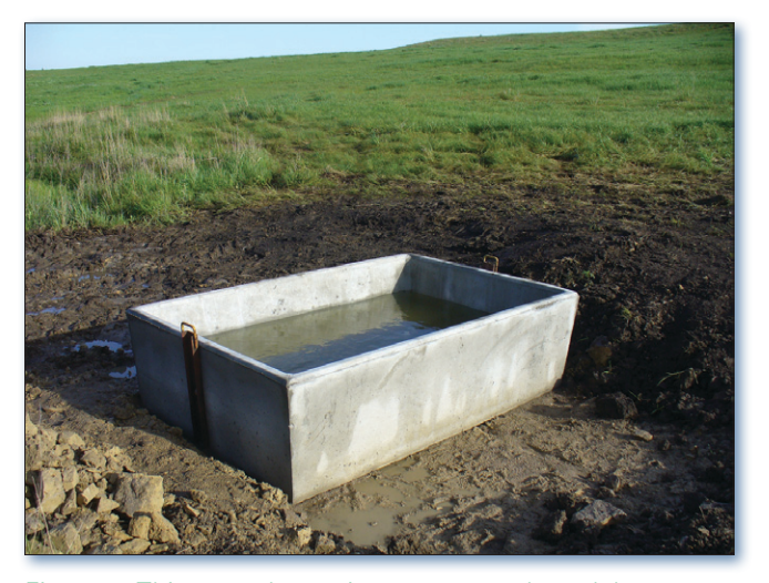
Figure 1. This new alternative water supply tank keeps cattle away from the creek.

KDHE listed 136 miles of Clarks Creek and its tributaries on the 1998 CWA section 303(d) list for excessive bacteria and failing to attain standards for primary recreation. Sampling conducted from 1990 to 1998 showed that levels of fecal coliform bacteria exceeded the state criterion for Kansas primary contact recreation of 200 fecal coliform colony-forming units (cfu) per 100 milliliters (mL). Data also showed that spring and summer nutrient and sediment concentrations generally exceeded desirable levels, including high springtime phosphorus levels. KDHE developed a total maximum daily load (TMDL) for bacteria in the Clarks Creek watershed in 2000.