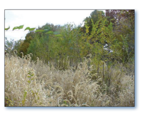
Figure 2. A Clarks Creek landowner planted 1,175 trees and shrubs on 7.5 acres of riparian forest buffer.

more than 150 acres of native-grass streamside buf-