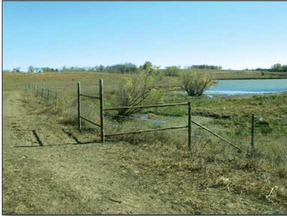
Figure 2. A landowner installed this livestock exclusion fence to reduce organic loading to surface waters.

4,606 linear feet of pipeline to support the alternative watering systems; and 44,574 linear feet of livestock exclusion fencing (Figure 2).