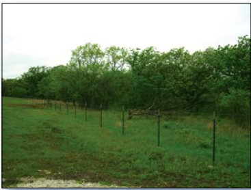
Figure 2. A landowner installed a fence to prevent cattle from accessing the stream.

A landowner, who later became an Eagle Creek WRAPS board member, allowed an Emporia State University team to monitor a segment where he