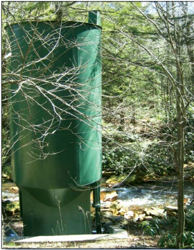
Figure 3 . Partners installed a limestone doser adjacent to Cherry Creek.

alkalinity-producing system that includes a treatment cell designed to precipitate aluminum while keeping iron in a soluble form), a Pyrolusite ® cell (bioremediation using limestone and bacteria to remove metals), and a Boxholm ® doser (a system that introduces lime to the water at a given rate). (See Figures 2 and 3.) The Cherry Creek mitigation effort used approximately 6,760 tons of limestone, not including the lime used for the doser.