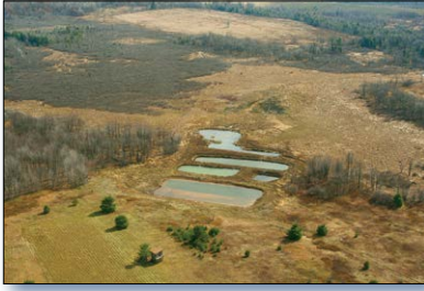
Figure 2 . Partners installed a successive alkalinity-producing system at the Everhart project site.