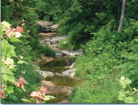
Figure 2. DEPRM added riffles, meanders and step-pool habitats during phase one of the project.