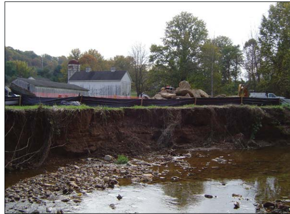
Figure 1. High-volume stormwater flows damaged this stretch of Minebank Run.

Before the restoration, Minebank Run exhibited severe bank incision, a disconnected floodplain, degraded fish and invertebrate habitat, loss of the riparian zone, and high sediment and nutrient loads from stormwater runoff. Stormwater conveyance channels, built to remove stormwater from roads quickly and not to protect hydrologic morphology, caused flashy, high-volume flows that eroded streambanks (Figure 1), exposed sewage trunk lines and damaged park roads and access bridges. Maryland Biological Stream Survey data confirmed that the number and diversity of macroinvertebrates and fish were lower than they should be, indicating that Minebank Run was in an unhealthy, degraded condition.