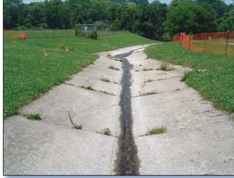
Figure 3. Minebank Run at Loch Raven High School, before restoration.