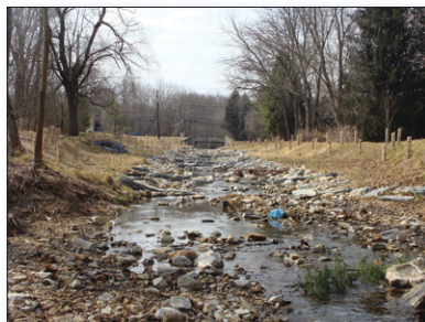
Figure 3. After restoration, the concrete channel seen in Figure 2 has been removed. Sewer lines running along both sides of the stream prevented partners from restoring a natural meandering pattern.