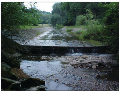
Figure 2. At this site (looking toward Pot Spring Road) before restoration efforts, Spring Branch flowed through a concrete channel. The concrete step seen here obstructed fish passage.

In phase II, DEPRM removed another 524 feet of concrete channel and restored 3.23 acres of native riparian buffer using 219 trees; 547 shrubs; 2,133 live stakes; 295 linear feet of live branch layering and 102 pounds of native riparian seed. Phase II restored 2,814 linear feet of stream.