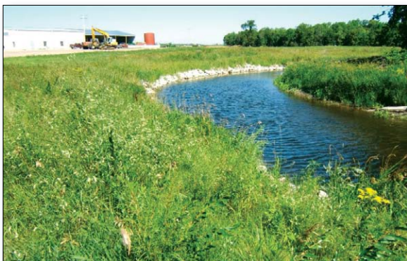
Figure 2. Farmers restored streambanks and installed vegetated buffer strips along the river.