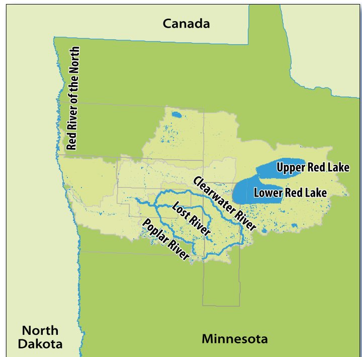
Figure 1. Northwestern Minnesota's Clearwater River is in the Red Lake River basin, a tributary of the Red River of the North.

The "Clearwater River Nonpoint Study," completed in the early 1990s, found that the monthly geometric mean fecal coliform bacteria concentrations exceeded the state's water quality standard in June, August and September. As a result, the MPCA added a 58-mile segment of Clearwater River (from its confluence with Ruffy Brook to its confluence with the Lost River) to Minnesota's CWA section 303(d) list of impaired waters in 2002; the reason given was failure to meet the state's bacteria water quality standards to protect the waterbody's aquatic recreation designated use.