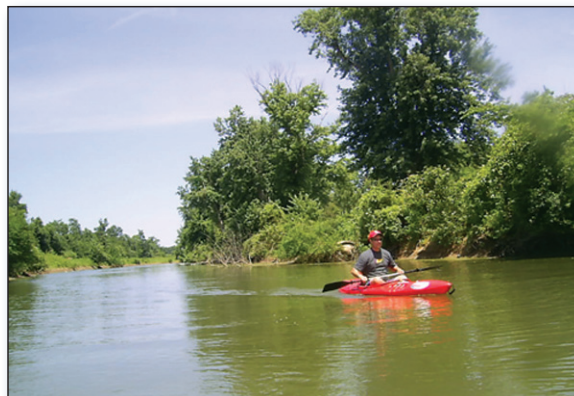
Figure 2. Eastern Missouri's Dardenne Creek is a popular site for water-based recreation activities.

The City of St. Peters and the SWCD, in coordination with the Alliance, supported the installation of two U.S. Geological Survey gauging stations in Dardenne Creek. The Alliance also led educational workshops for students, organized an annual "Dardenne Day" to educate the public about water quality, developed a website, and helped to organize a volunteer monitoring Stream Team.