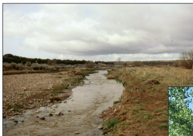
Figure 2. The Santa Fe River, below the wastewater treatment plant, in 1997 (before restoration).

Restoration efforts transformed the impaired reach of the Santa Fe River from an erosion-prone, barren area (Figure 2) into a lush preserve with abundant riparian vegetation and wildlife (Figure 3). In 1997 the WildEarth Guardians collaborated with the Santa Fe Municipal Airport to install fencing to keep grazing livestock away from riparian areas and prevent them from roaming onto airport runways. Initial project funding came from a U.S. Fish and Wildlife Service Partners Grant. In 2000 WildEarth Guardians received a CWA section 319 grant to expand the project onto lands owned by the city of Santa Fe. The partners implemented a number of BMPs, including removing exotic vegetation and planting native vegetation—more than 5,000 cottonwood trees and 15,000 willow trees. The BMPs also included additional fencing, levee removal to allow high flows to reach the floodplain, wetland creation, and outreach and education activities.