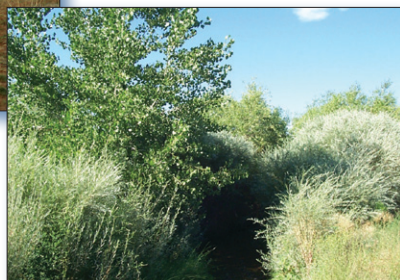
Figure 3. The Santa Fe River in 2004 (same location shown in Figure 2, after restoration).

In 2002 the Santa Fe Watershed Association developed the Santa Fe River Watershed Restoration Action Strategy (WRAS), providing a planning basis on which restoration activities were developed and funded. The restoration work addressed several WRAS goals, including planting the riparian corridor with native vegetation to increase shading, stabilizing banks and improving water quality. The Santa Fe City Council also passed a resolution that recognized the ecological significance of the river segment and encouraged its protection and restoration.