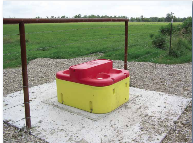
Figure 2. Installing alternative water supplies and cross-fencing allows optimal grazing management, which improves pasture condition, reduces erosion of soil and nutrients, and ultimately improves water quality.

The Oklahoma cost-share program provided $4,142 in state funding for BMPs in this watershed from 2001 to 2006 through the Woodward County Conservation District, and landowners contributed $7,564 through this program. An additional $23,000 in BMPs was installed in 2009. NRCS has spent more than $2 million for implementation of BMPs in