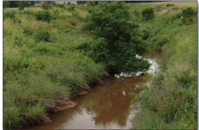
Figure 2. Wildhorse Creek following the implementation of best management practices.

The Rotating Basin Monitoring Program is supported by U.S. Environmental Protection Agency CWA section 319 funds at an average annual cost of $1 million. Monitoring costs include personnel, supplies, and lab analyses for 18 parameters from samples collected every 5 weeks at about 100 sites. In-stream habitat, fish, and macroinvertebrate samples are also collected. Approximately $600,000 in CWA section 319 funding supports statewide education, outreach, and monitoring efforts through the OCC's Blue Thumb program. The Oklahoma cost-share program provided $11,719 in state funding for BMPs in this watershed through the Stephens County Conservation District, and landowners contributed $8,035 through this program. The NRCS spent approximately $1,250,000 for implementation of BMPs in the watershed from 2008 to 2011 through NRCS EQIP, CSP, and general technical