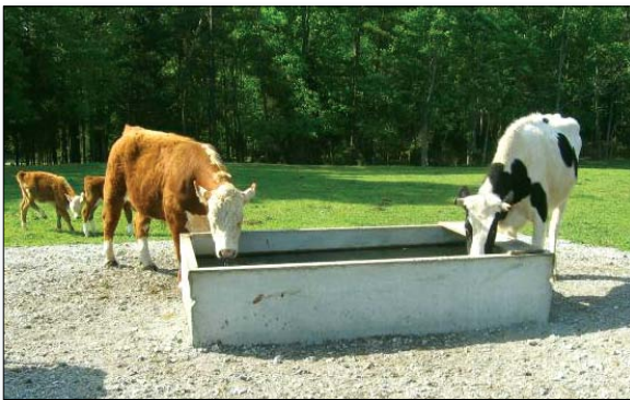
Figure 2. Project partners installed alternative water sources for cattle. A gravel base area prevents erosion around the tank.

In 2006 project partners developed and began to implement a watershed-based plan to reduce nonpoint sources of FC bacteria. The Clemson University Cooperative Extension and the U.S. Department of Agriculture's Natural Resources Conservation Service (NRCS) coordinated with local agricultural producers to implement the following BMPs: 19 alternative water source units for livestock and 15,193 feet of pipeline to direct water from wells to alternative watering sources for livestock; 27,385 feet of fencing to exclude livestock from the waterbodies; 14,994 square feet of heavy-use protection areas (creating a stable, non-eroding surface in areas frequently and intensively used by people, animals or vehicles); livestock streambank crossings; and 27,385 feet of streambank and shoreline protection (Figure 2).