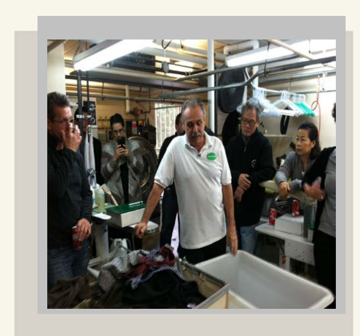
Wet Cleaning Demonstration

To view the video, go to: https://youtu.be/W3Qz3mWc_BM