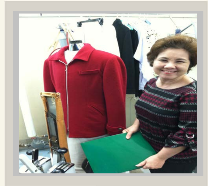
End Results of Wet Cleaning