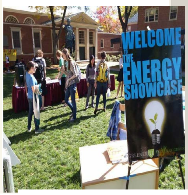
Sustainability at Brown University

http://www.sustainablecitynetwork.com/topic_channels/commun ity/article_70c5e52a-2fe9-11e5-b011-8b7d83ef4f8e.html?mode=story